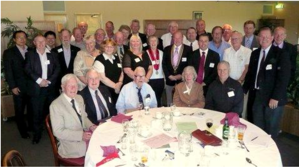
What a sober lot – Only 1 beer between the lot of them !

President Tom then asked members to assemble for the Club Photo which will be used at the District Conference in February, at Geelong, in 2010.